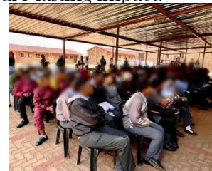
Participants listening attentively

The program concluded with a powerful pledge ceremony where participants committed to upholding dignity and respect in their schools and communities. Resources developed through this initiative will be shared widely with educators and learners across South Africa to ensure lasting impact.