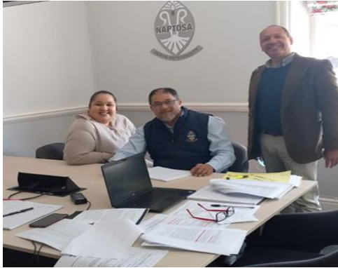
NAPTOSA WC Staff building a strong case