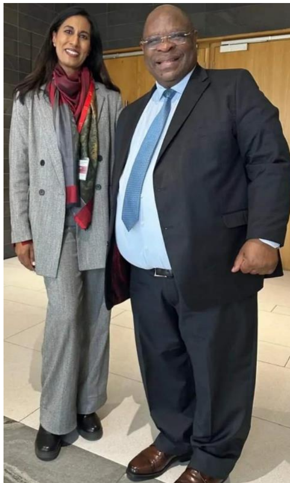
NAPTOSA’s Thirona Moodley with Chief Justice Raymond Zondo

He urged workers and unions to leverage constitutional protections to safeguard labour rights, stressing that the Constitution is not merely aspirational but a practical tool for achieving justice and equity.