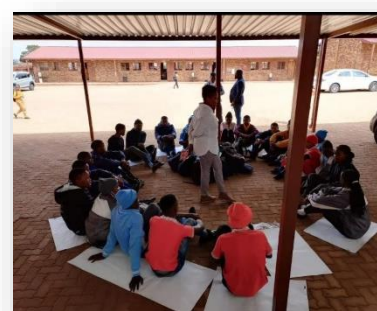
Involving the Boy child in the fight against GBV is imperative

This is just the beginning. NAPTOSA aims to expand the reach of this program to more districts and ultimately take it nationally, ensuring that the culture of dignity and non-violence becomes an enduring pillar in schools across South Africa. Together, we can create a brighter, safer future for all learners and educators.