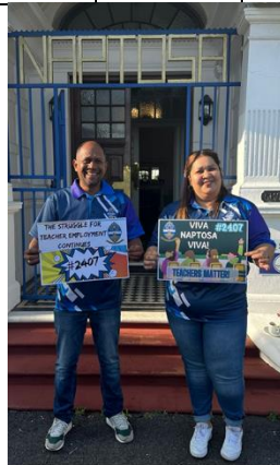
NAPTOSA WC Staff Celebrating their Well-Deserved VICTORY