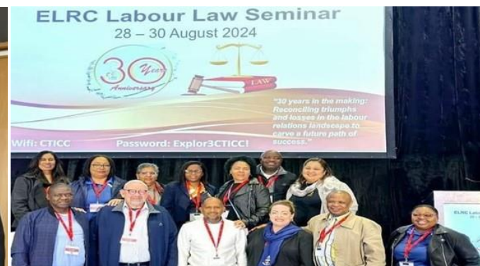
Above: NAPTOSA’s Intergenerational Delegation at the ELRC Labour Seminar